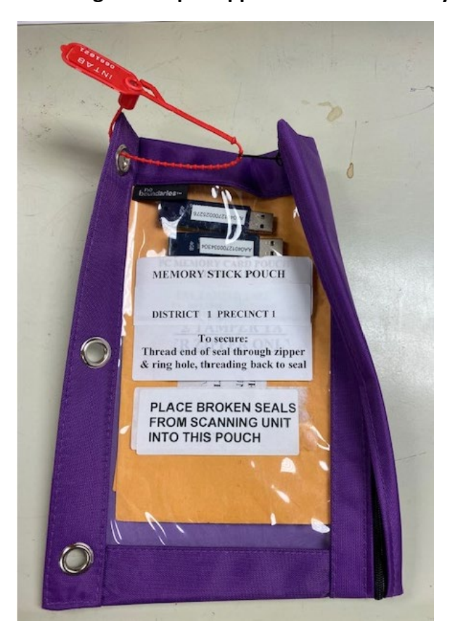
Figure 2 – Sealing the Purple Zipper Pouch for Memory Sticks